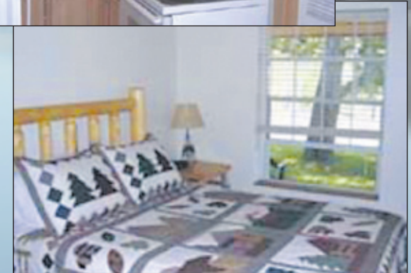
Interior Views of One Bedroom Condo