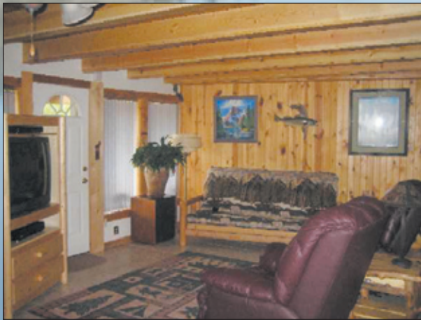
Interior Views of Two Bedroom Condo

We invite you to stay in one of our newly remodeled condos, the perfect place for a winter weekend getaway or an action packed summer vacation!